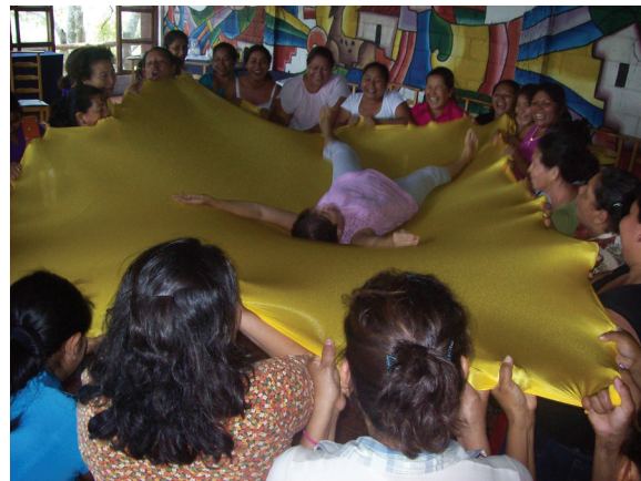
Women Moving Money Women in El Salvador experience supporting each other in a workshop focused on the meaning of money in their lives.